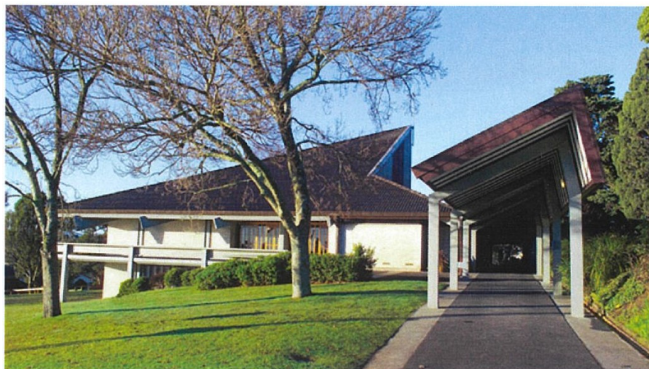
All Saints' Anglican Church, Howick, Auckland

Whether newcomer or regular friend of our series, everyone is welcome to our Autumn concerts at All Saints Church, Howick. We hope that the sun continues to shine on our series and you will enjoy coming often to join us. You will hear solos, duos, trios, quartets and a full symphony orchestra over the coming weeks. New Zealand IS a musical nation. Let's be part of this, enjoying Auckland's diversity.